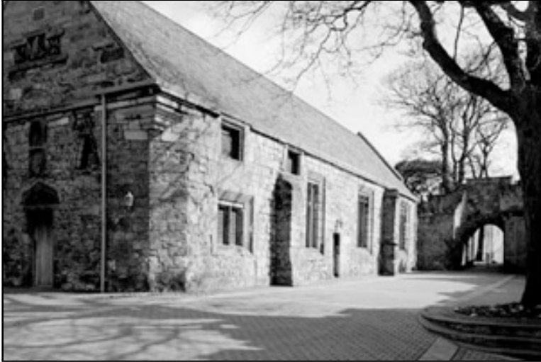
Top: The ruins of the Chapel of St. Leonard's College in 1900. Bottom: The Chapel today, fully restored in 1948.